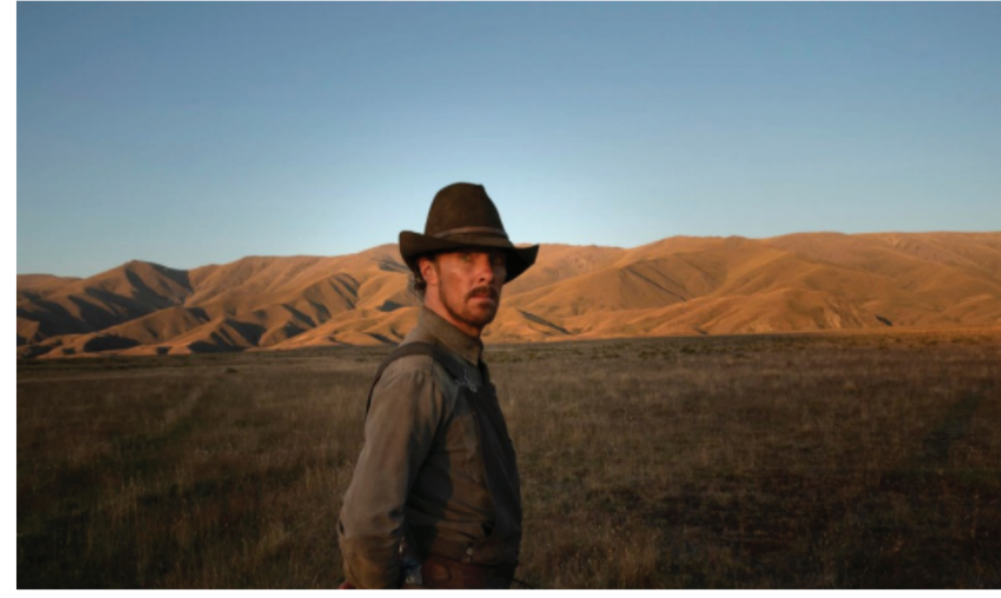
The Power of the Dog, starring Benedict Cumberbatch, is one of the films announced this week for the 21st edition of the Whistler Film Festival.

Movie buffs got their first glimpse at the lineup for the 21st edition of the Whistler Film Festival (WFF) this week, with a number of world premieres on tap.